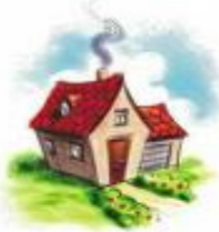
In your home