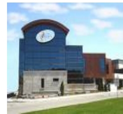
At Roger's House